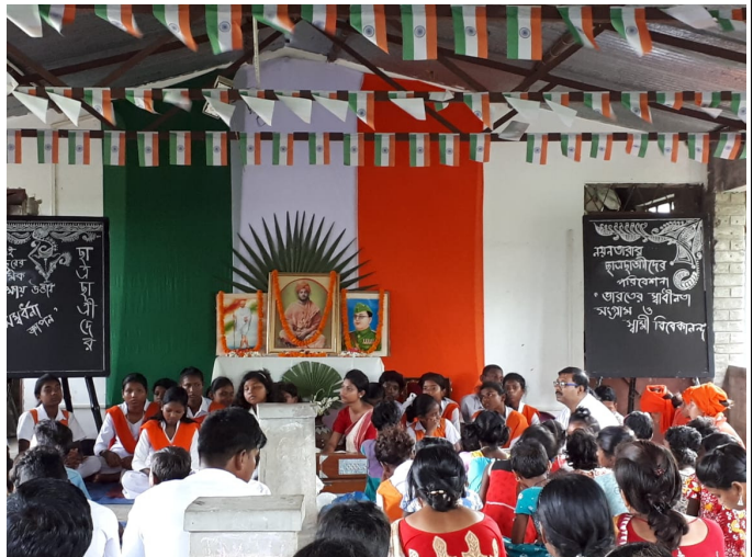
Felicitation of Madhyamik 2018 Batch