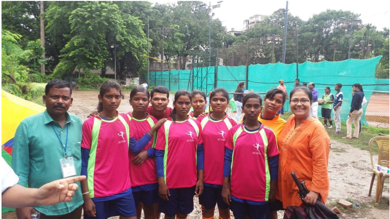
Participation in Kolkata Gives Sponsored Under 18 Football Tournament for Girls